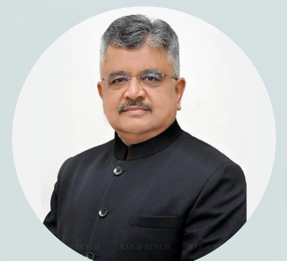
Mr. Tushar Mehta Solicitor General of India

VALEDICTORY SESSION (30th September, 2022; Time: 5:00 pm to 6:30 pm)