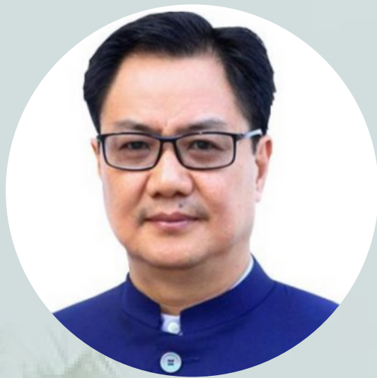
Shri Kiren Rijiju Hon'ble Union Minister of Law & Justice, Govt. of India