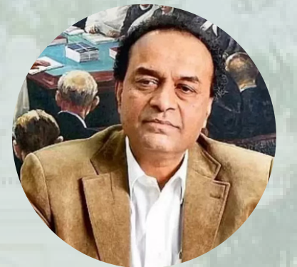
Mr. Mukul Rohatgi Senior Advocate Supreme Court of India