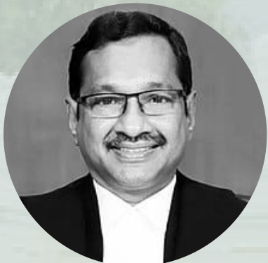
Hon'ble Mr. Justice M.M. Sundresh Judge Supreme Court of India