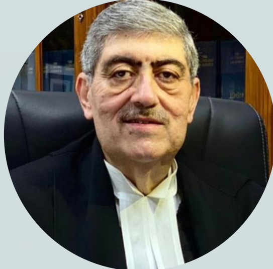
Hon'ble Mr. Justice Sanjay Kishan Kaul Judge Supreme Court of India