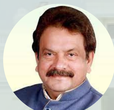
Prof. S.P. Singh Baghel Hon'ble Minister of State, Ministry of Law & Justice, Govt. of India