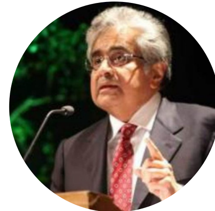
Co-chair of the Session Shri Harish Salve KC Senior Advocate, Former Solicitor General of India